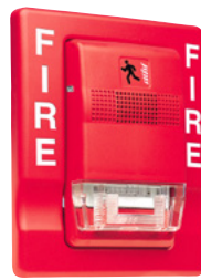
Genesis Chime-strobe with optional trim plate

Genesis chimes and strobes mount to any standard one-gang surface or flush electrical box. Matching optional trim plates are used to cover oversized openings and can accommodate one-gang, two-gang, four-inch square, or octagonal boxes, and European 100 mm square.