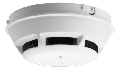
Model FDO421 Photoelectric Smoke Detector

The smoke chamber is designed to manage light dissipation and extraneous reflections from dust particles or other non-smoke, airborne contaminants in such a way as to maintain stable, consistent detector operation. When smoke enters the detector chamber, light emitted from the IRLED is scattered by the smoke particles and is received by the photodiode (see: images on page 2).