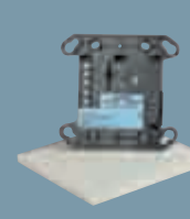
Single input interface module HTRI-S Order no.: 500-033370