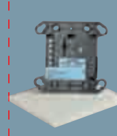
Dual input interface module HTRI-D Order no.: 500-033360