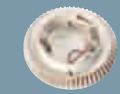
Audible base ABHW-4B Order no.: S54320-F13-A1