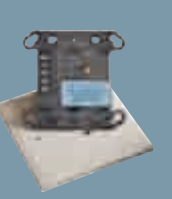
Line isolator HLIM Order no.: 500-033170