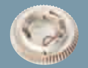
Audible base ABHW-4S (520Hz) Order no.: S54320-F14-A1