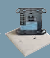
Single input interface module with relay HTRI-R Order no.: 500-033300