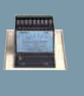
Conventional zone module HZM Order no.: 500-034850