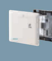
Input/output module FDCIO422 – 4 inputs, 4 outputs – Class A and B wiring Order no.: S54322-F4-A1