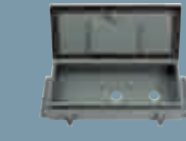
Optional water-tight enclosure NEMA 4X FDBZ-WT Order no.: S54319-B26-A1