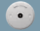
Ceiling mount remote lamp RL-HC Order no.: 500-033230