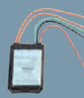
Mini single input interface module HTRI-M Order no.: 500-034000