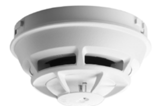
Model OH921 Multi-Criteria Fire Detector

Each Model OH921 detector provides three (3) pre-programmed parameter sets that can be selected by the FACP.