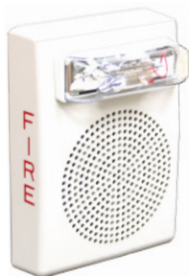
SE-MC-W Speaker Strobe