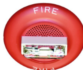
SE-MC-CR Speaker Strobe