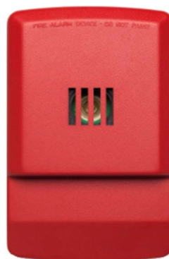
Model SLHR-N Horn

The `SL'-series is apt for indoor wall-mount applications. The Model `SLH'-series horn appliances work in either 12V or 24VDC, whereas the Series `SLSW' and `SLHSW' strobe and horn-strobe devices are specifically for 24V operation.