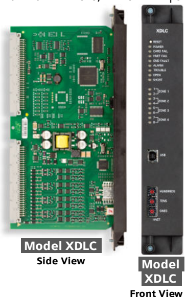
Model XDLC Side View

NOTE: Refer to installation manual: P/N – A6V101040156 to ensure Model XDLC compatibility with the Siemens FACP's intended for use in the given application.