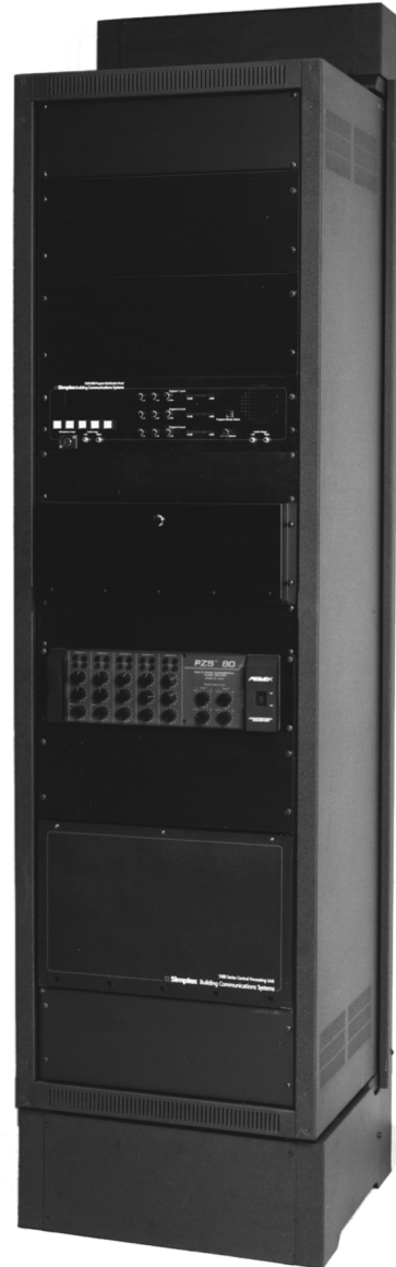
Complete Wall Rack Assembly (Shown Closed with Typical Rack-Mounted Equipment Installed, Not Included)