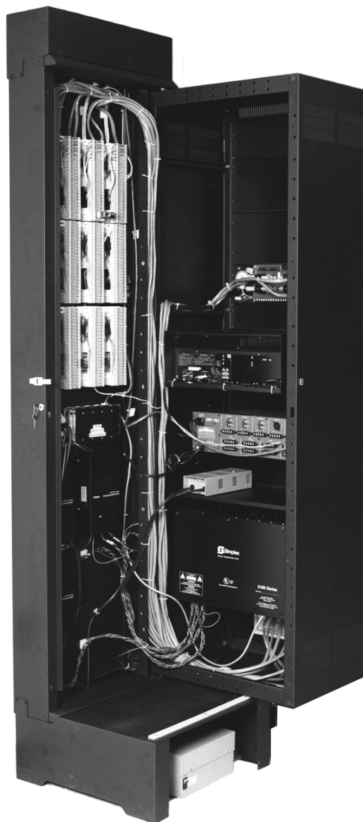
Complete Wall Rack Assembly (Shown Open with Typical Rack-Mounted Equipment Installed, Not Included)